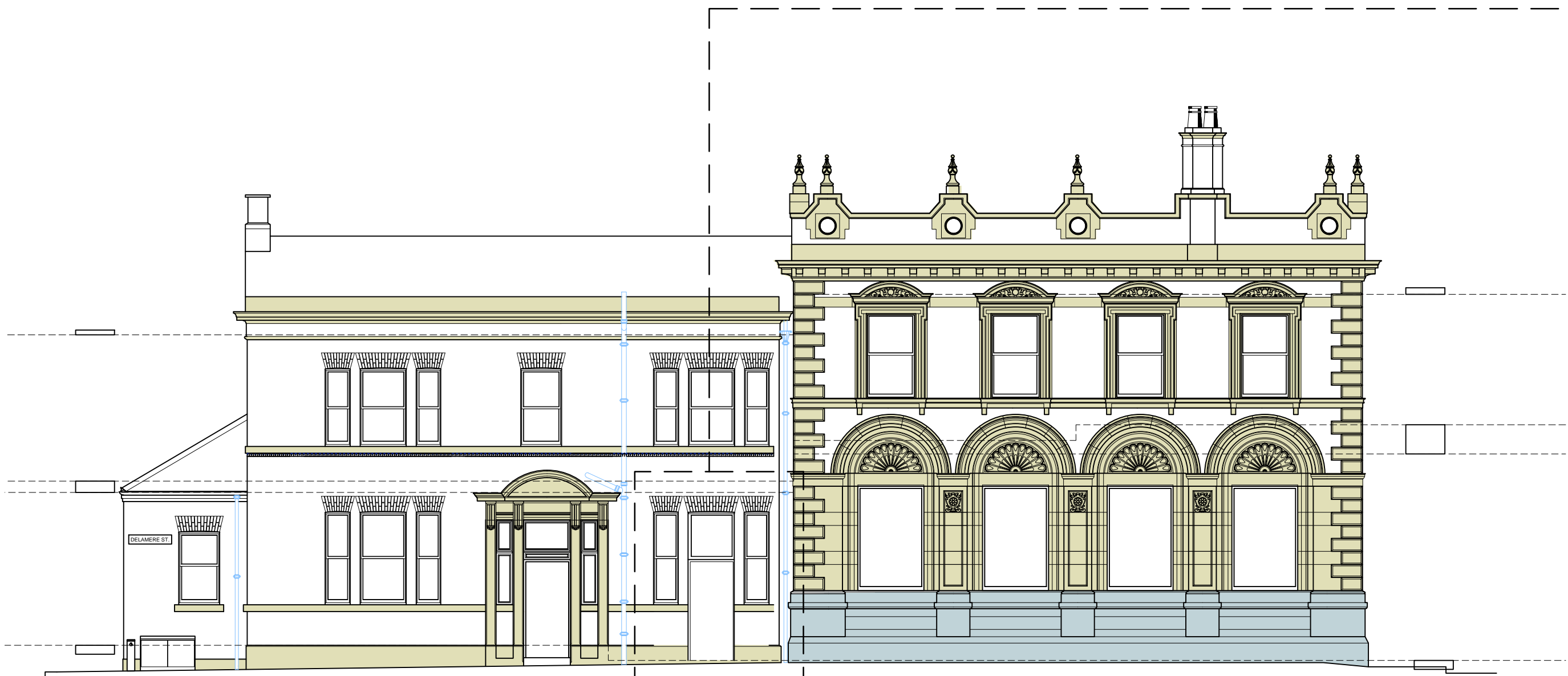
SIDE ELEVATION [DELAMERE STREET], LOOKING WEST