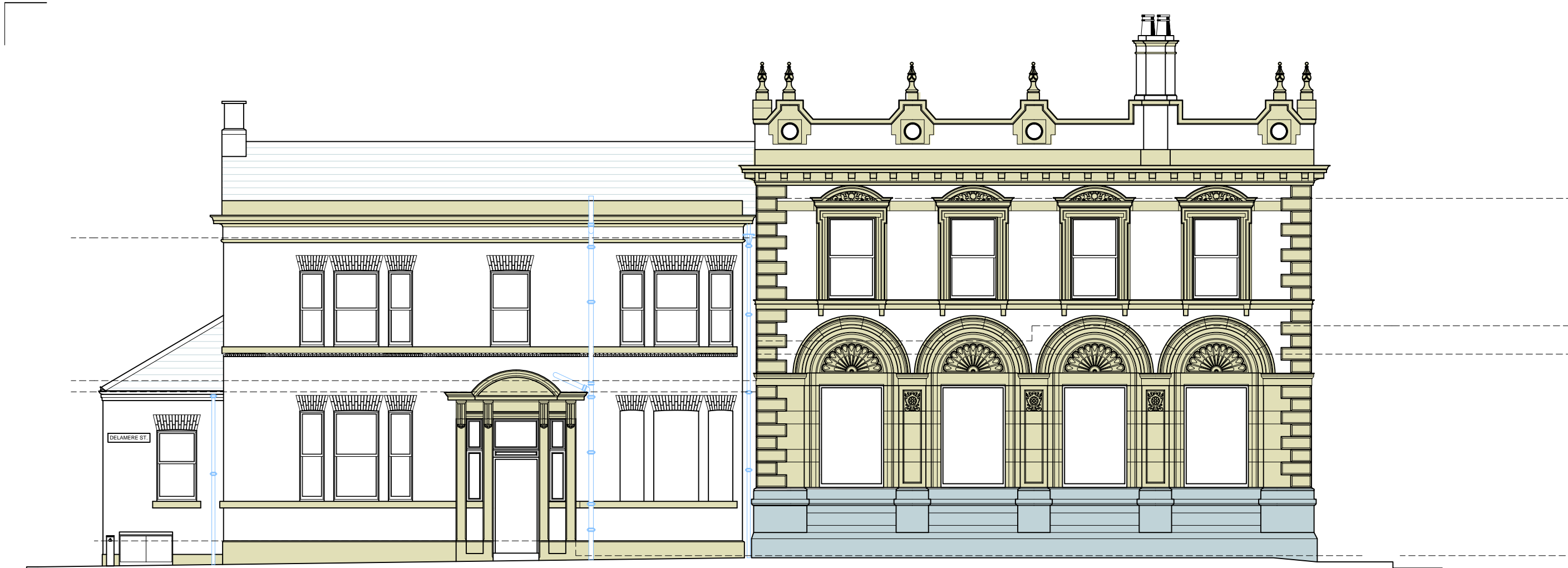
SIDE ELEVATION [DELAMERE STREET], LOOKING WEST